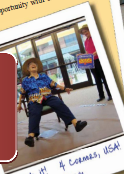
I made it! 4 corners, USA! 7/28/11